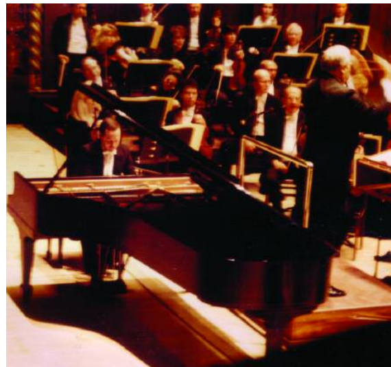
Detroit Symphony Orchestra