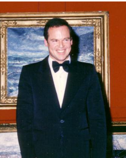
Artistic Director of Concerts at Sotheby's London 1986-96