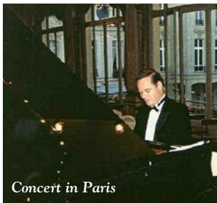
Concert in Paris