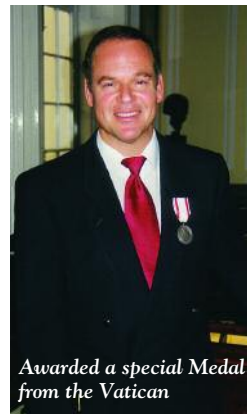
Awarded a special Medal from the Vatican

The introduction of his innovative School Master Class and Gala Performance Program has been very well received. The desire to give back to the community and share his invaluable experience with talented piano students is his primary motivation. It is his sincere hope that the Master Classes will inspire students to greater heights in their musical careers.