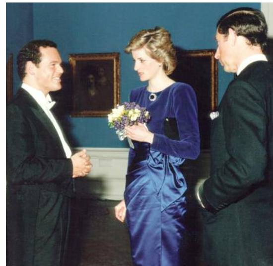
The Prince and Princess of Wales